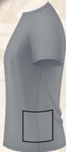
Bottom Hem Left