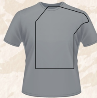
Upper Left Shoulder