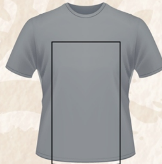
Off the Bottom