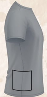
Bottom Hem Right