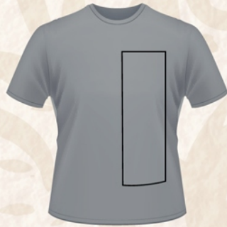
Down Left Side

The hottest thing on the market today is the use of unique print locations of art in the creation of impactful, fashion forward garments. The boundaries of shirt design have been shattered and anything is possible today. Utilize Target's unique print locations to add the cool factor to your client's brands.